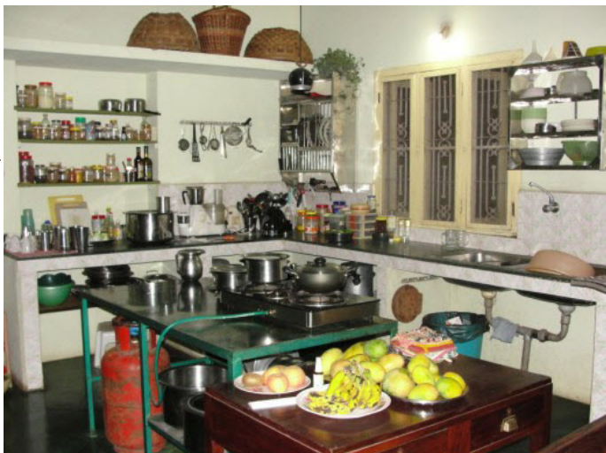
This is my kitchen in India.